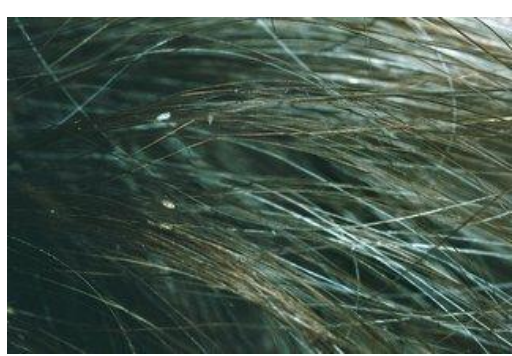
Head lice eggs (nits) are yellow, brown or white (empty shells) and attached to the hair

Head lice sometimes can make your head feel: