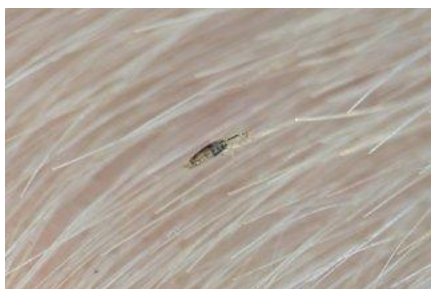
Close-up view of a head louse