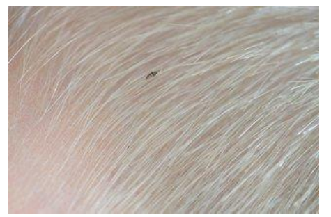
Head lice are small insects, up to 3mm long, and can be difficult to spot